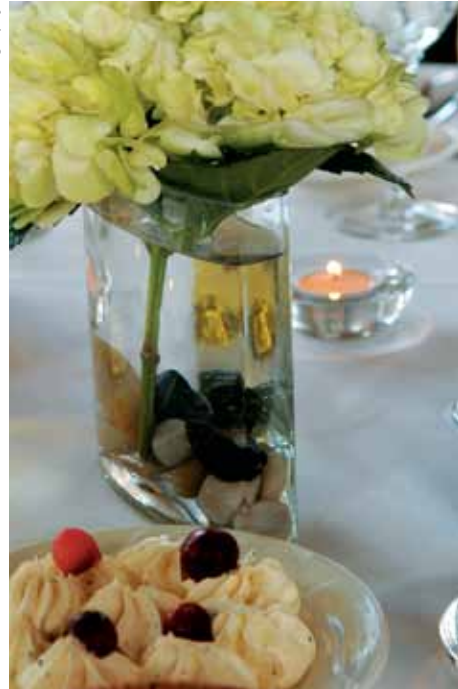
Prices do not include Taxes or Gratuities.