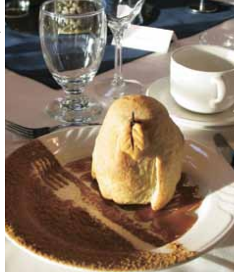
Prices do not include Taxes or Gratuities.